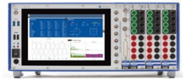
Individual: Up to 12 x Voltage, 12 x Current and Auxiliary Inputs