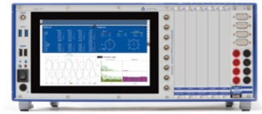
4 x Voltage, 4 x Current (Clamp Input, 5 Vrms)